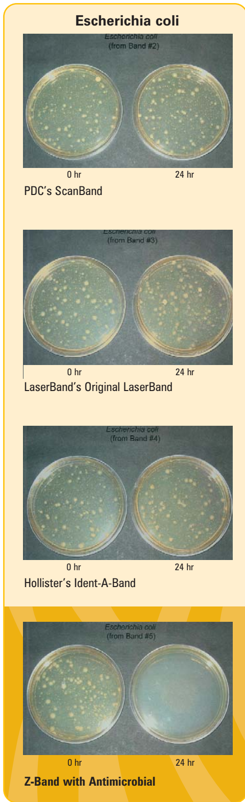
Figure 2. Escherichia coli at 0 HR and at 24 HR