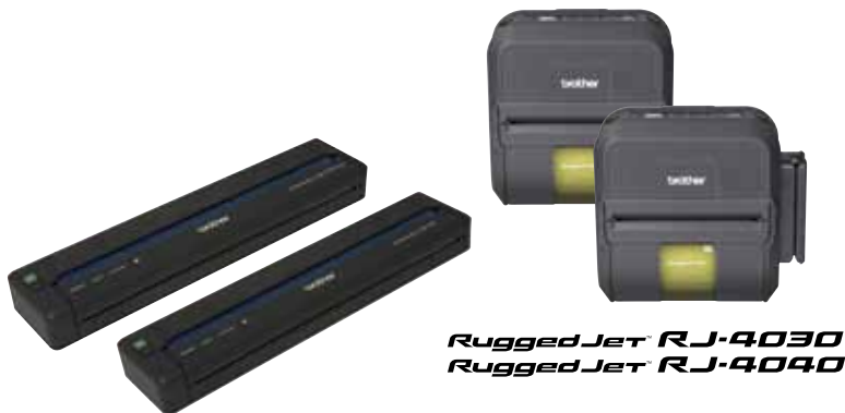
RuggedJet™ RJ-4030 RuggedJet™ RJ-4040