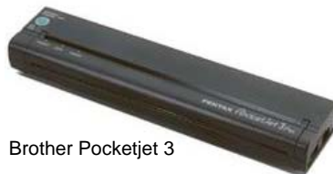
Brother Pocketjet 3

Brother PocketJet 3 printers were designed with the dual objective of providing excellent print quality while lowering the cost of mobile printing.