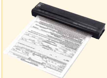
PocketJet3, PocketJet 3 Plus